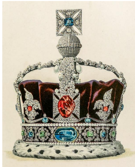
Imperial State Crown of Queen Victoria showing the Stuart Sapphire set in a hexagonal gold mount.

For Queen Victoria's coronation, the stone was placed in the front of her new crown. In 1909, Edward VII had it moved to the back of the crown to make room for the Cullinan II diamond.